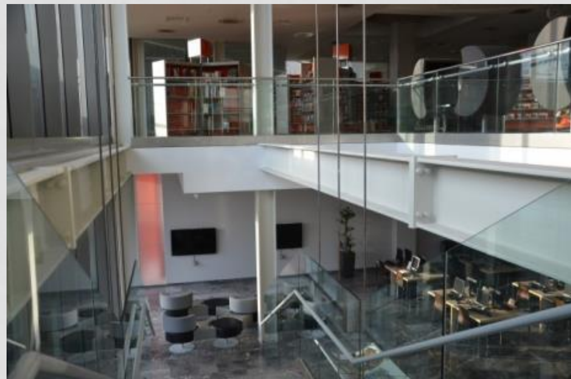
Kranj City Library