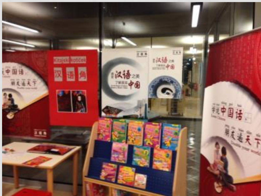
Celje Public Library Chinees Corner