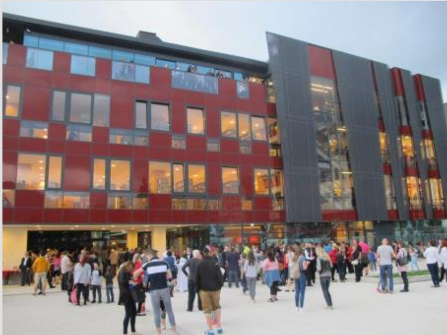
Radovljica Public Library