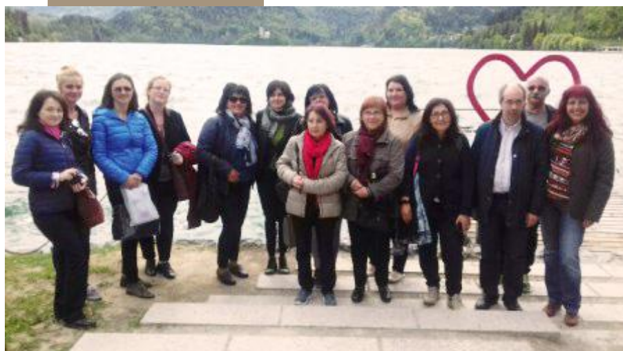
Members of the team project