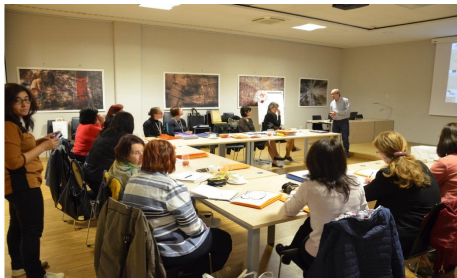
Meeting of project group in Kranj