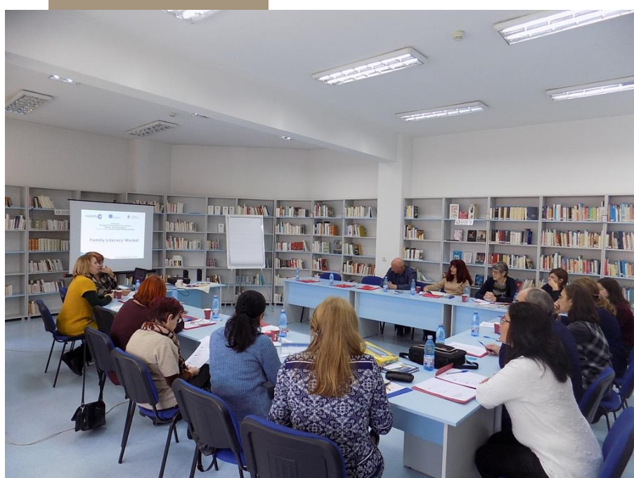
Kick-off meeting in Cluj – Napoca in Romania

Literacy is considered a factor in the economic competitiveness of a country. People with better literacy are more aware of the world and of themselves, better at understanding new ideas and change, better at judging the value of things; they have better health, higher income, and better participation in civic life than people with lower literacy skills.