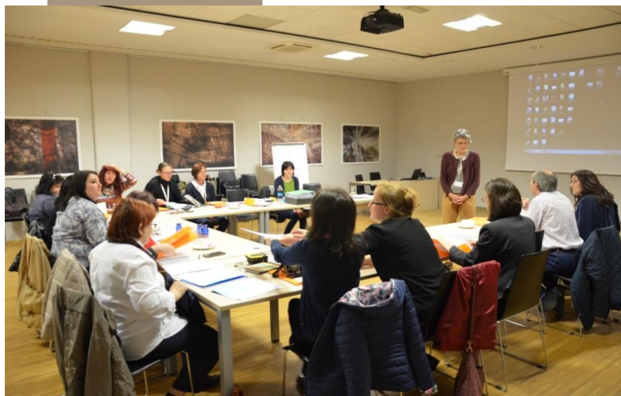
Meeting of project group in Kranj